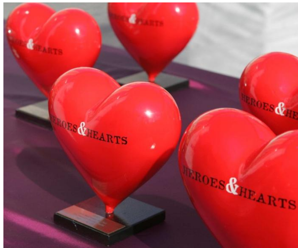
Heroes & Hearts Awards (click to view full-size)

The Heroes & Hearts Award recognizes individuals who inspire others through exceptional community service. The "Heroes & Hearts Luncheon" is an outgrowth of 2004's Hearts in San Francisco city-wide art installation and fundraiser project. In addition to spotlighting exceptional community heroes at the February 10 luncheon, 14 new heart artworks will be displayed and six "table top" hearts will be auctioned with proceeds benefiting